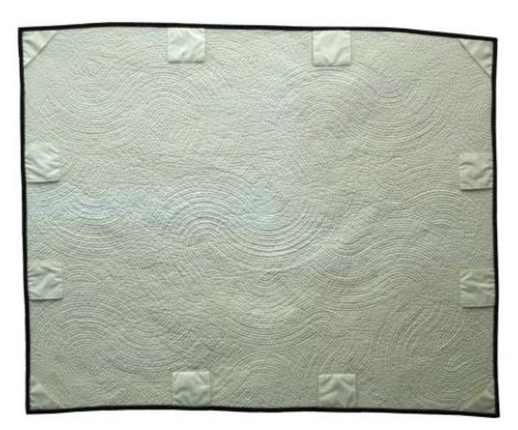
Back view of artwork