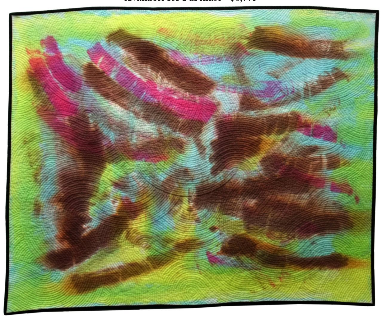
Exhibition and Publication History

--Xanadu Gallery Art Catalogue, July 2014, page 29.